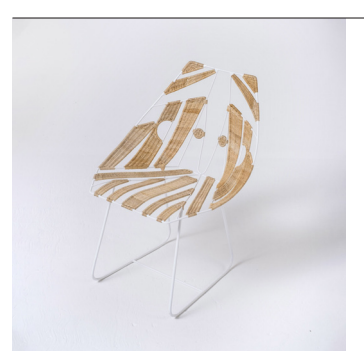
Robinson 46 × 54 × 67 cm 18 ¼ × 21 ¼ × 26 ½ "